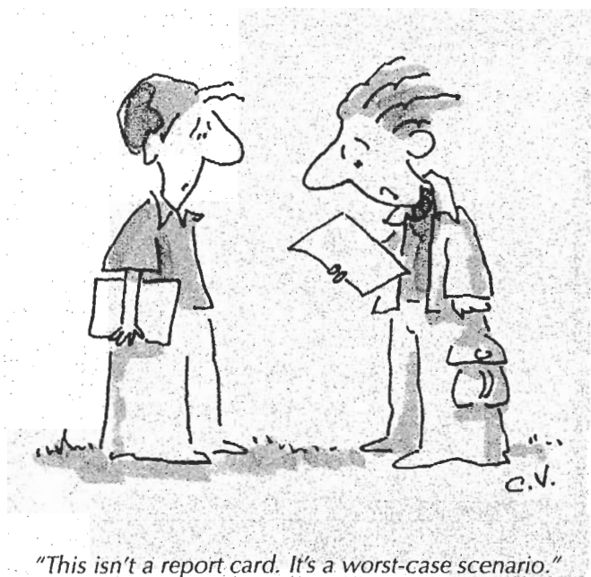
"This isn't a report card. It's a worst-case scenario."

cepts inaccurate and invalid? Why then should such information be "averaged in" when determining students' grades?